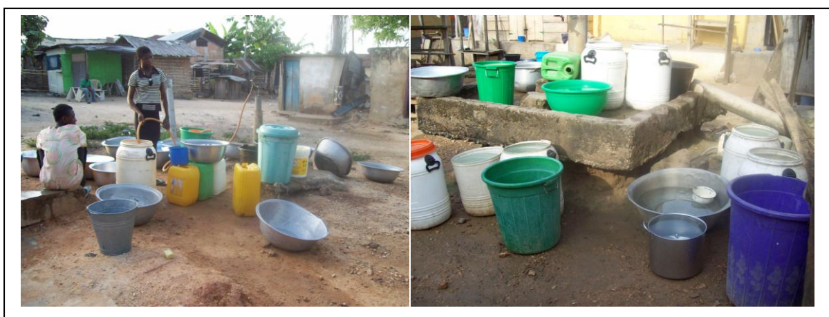
Figure 3.2: Typical Situation at the Standpipe in the Morning

The amount of water pumped a day could only supply water to the town for one hour (6am – 7am). Before 6am customers who patronise standpipes would deposit their containers at the stand post and vendors fill for them even if they are not around