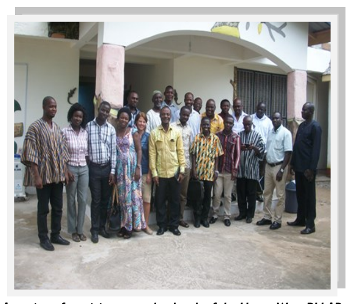
A section of participants at the lunch of the Upper West RLLAP

The Core Team pledged their commitment towards the sustainability of the initiative in their district.