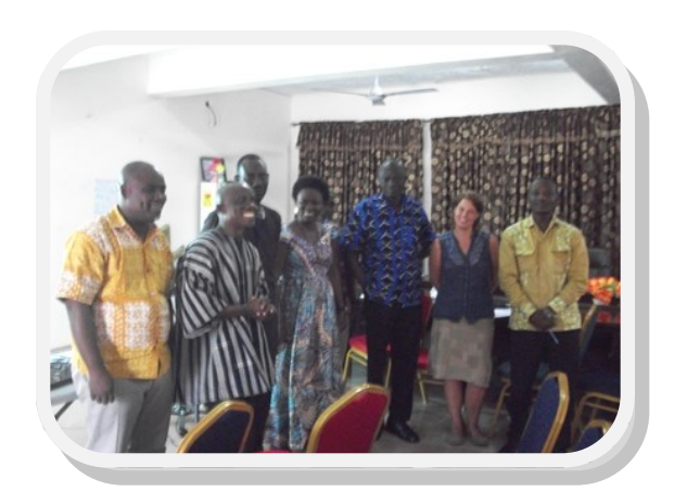
Regional-Level LA Core Team inaugurated

The team is expected to identify stakeholders for LA, facilitate content development, lead dissemination of information, advocacy, reporting on the provision of logistics and led organizational arrangements for the platform. They are also expected to make follow ups on all agreed actions of the platform.