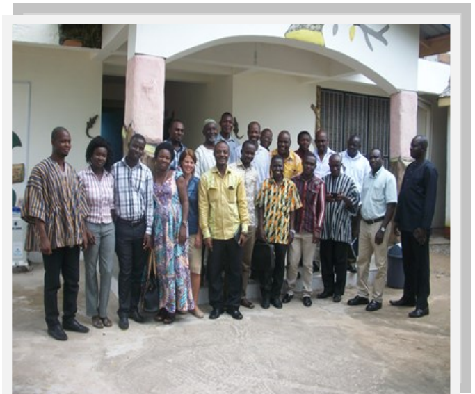
A section of participants at the lunch of the Upper West RLLAP

The Core Team pledged their commitment towards the sustainability of the initiative in their district.