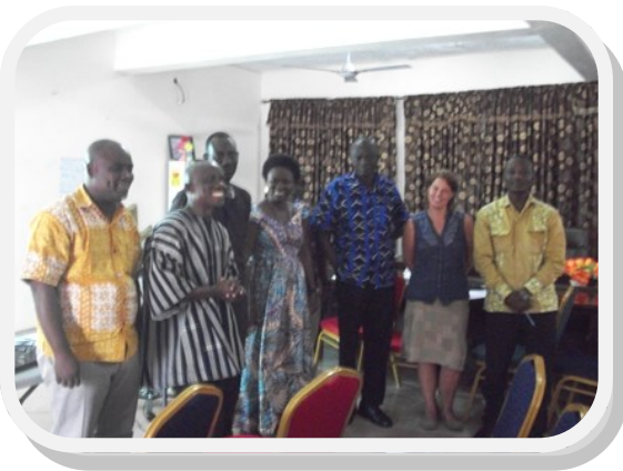
Regional-Level LA Core Team inaugurated

The team is expected to identify stakeholders for LA, facilitate content development, lead dissemination of information, advocacy, reporting on the provision of logistics and led organizational arrangements for the platform. They are also expected to make follow ups on all agreed actions of the platform.