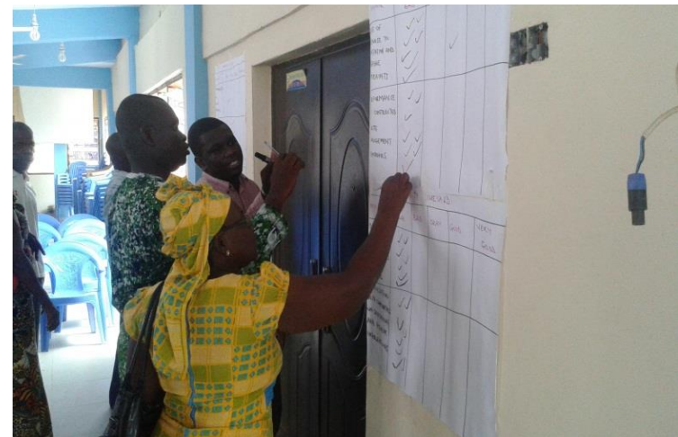
Citizens assessing sanitation and hygiene services rendered by the Assembly using community scorecards