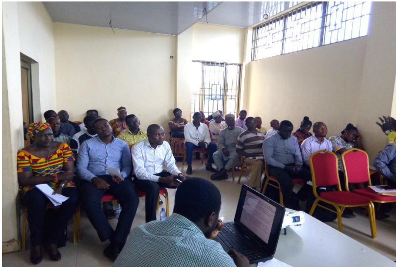
ASEMA Stakeholders' Forum