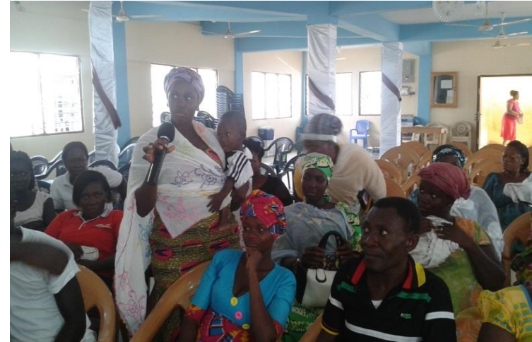
Participants raising concerns on sanitation and hygiene within their communities