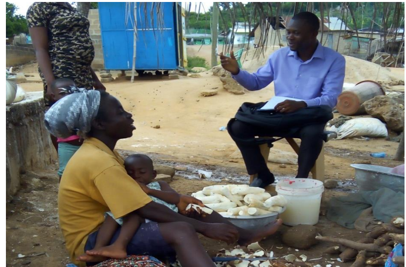
Interviewing a citizen at Bantama - ASDA