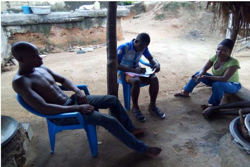
Interviewing a citizen at Ayiresu - ASDA