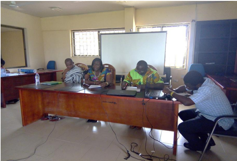
ASDA Stakeholders' Forum