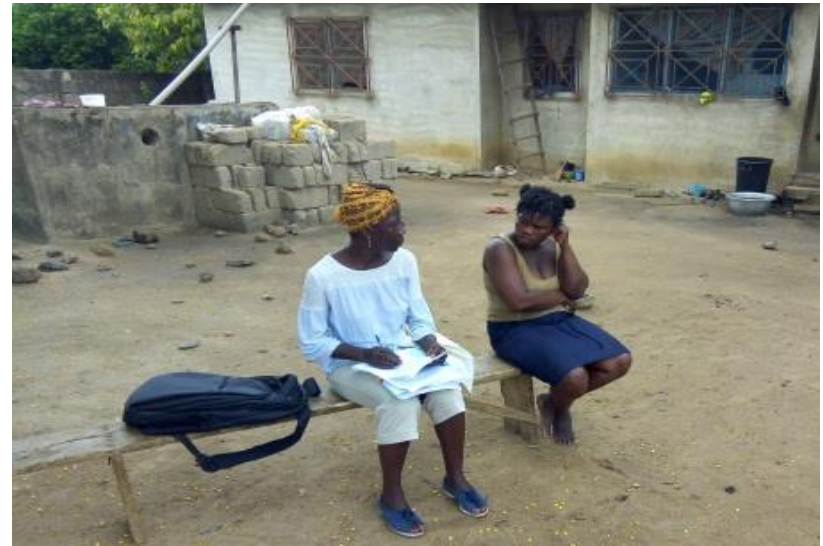
Enumerator interviewing a citizen at Kpormetey - ASEMA