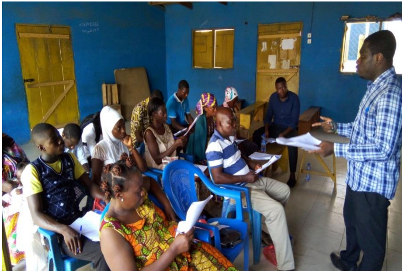
Training on V4C Data Collection Tools